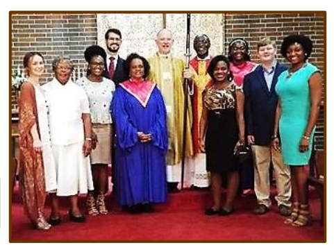
On May 19, the Episcopal Church Women hosted the 2019 Graduation Recognition Program, celebrating our youth and young adults who achieved academic rites of passage.